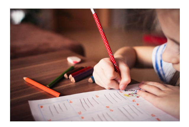
Money must-haves for better financial health as the busy back to school season begins: